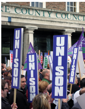
There is more information on the cuts on page 2

“It is now clear that the promises to protect front line services were lies.”